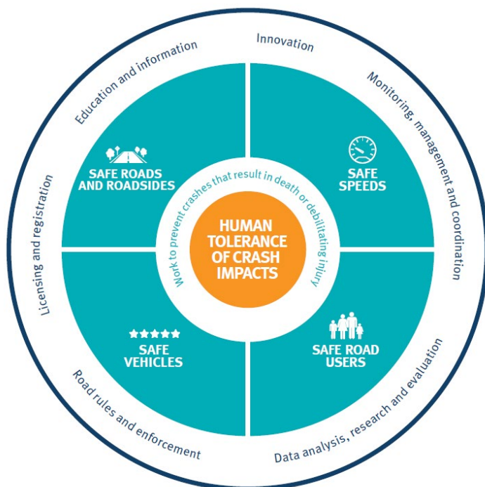
Figure 3.1.2 – Safe system principles