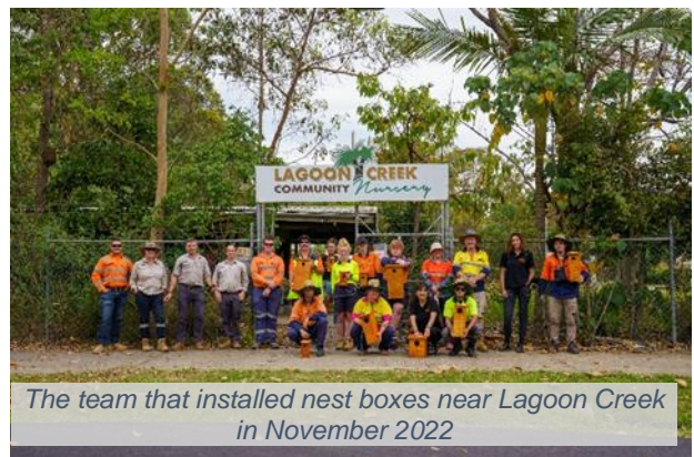
The team that installed nest boxes near Lagoon Creek in November 2022

We look forward to continuing our work with these groups during 2023.