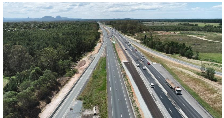
Realigned northbound and southbound traffic looking north from Pumicestone Road

All works are subject to weather and construction conditions.